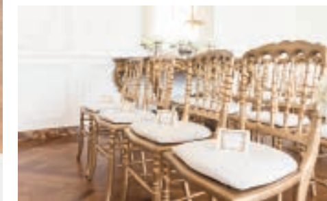
The White Drawing Room