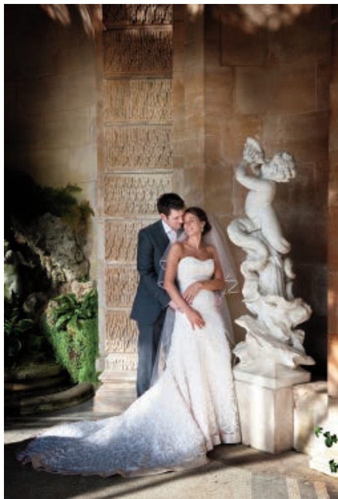
The White Drawing Room