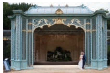
St. Michael and All Angels Church